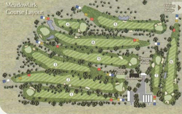
Meadowlark Course Layout

Local Rule: • If playing the traditional cups, free relief is given if the 15' cup is obstructing play in any way. (Free relief is 6' to the nearest point of relief)